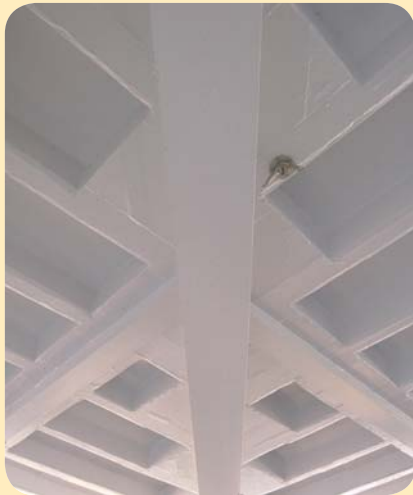
Existing Ceiling Detail