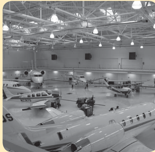
Airplane Maintenance Hanger