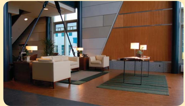
Gate Waiting Area