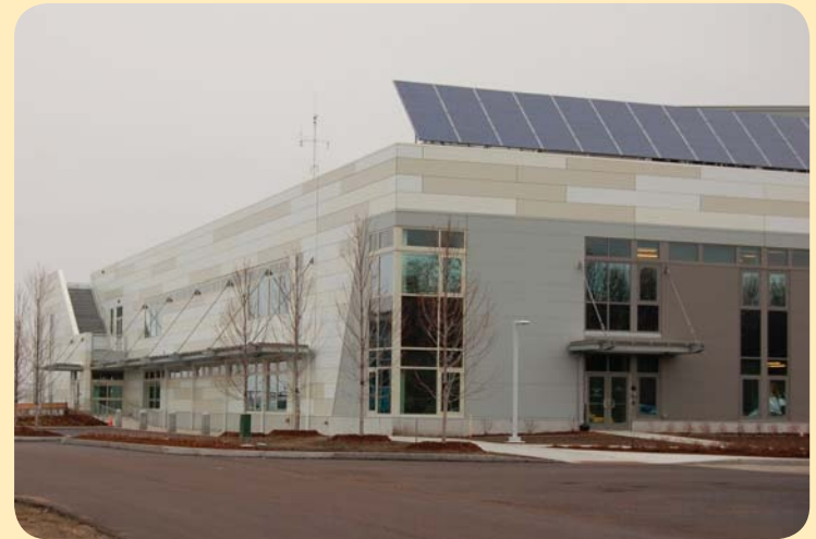
South West Corner

Heritage Flight is a private charter jet service located at the south end of the Burlington International Airport runway. TruexCullins was tasked with renovating an existing 1948 US Army aviation hanger. The new program included public spaces, offices, aircraft maintenance space and a US Customs and Border Patrol processing office. The skin of the building was completely removed to facilitate major structural renovations and two areas of expansion. My role was to work closely with the project manager and consultants to develop the working drawings while maintaining the design intent. The photo of the existing ceiling became an important part of the team's decision to expose that ceiling whenever possible. Coordination of the new mechanical and lighting elements became integral to the expression of the existing structure. The owner shared our interest in creating an environmentally responsible design, which includes a green roof, solar panels, storm water management and several day lighting strategies. The new building is expected to earn Leed Silver Certification. This project is currently under construction and will be completed in 2009.